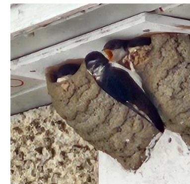
Hungry house martins waiting to be fed.....